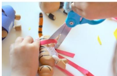
Itty Bitty Sunshine

Free the Animals! PRACTICING SCISSOR SKILLS